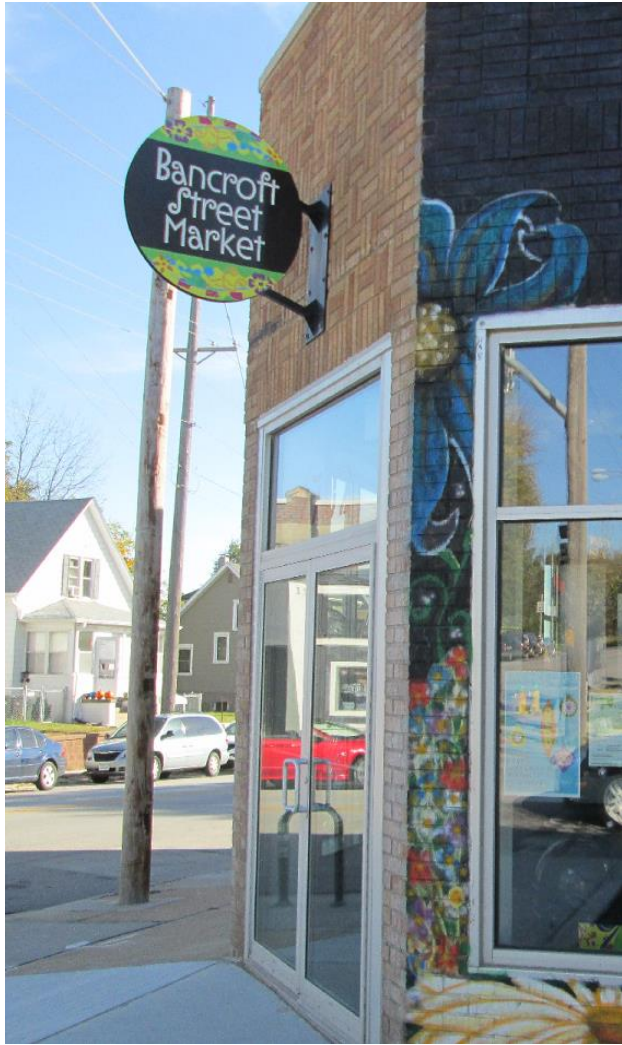
Bancroft Street Market 2702 South 10 th Street